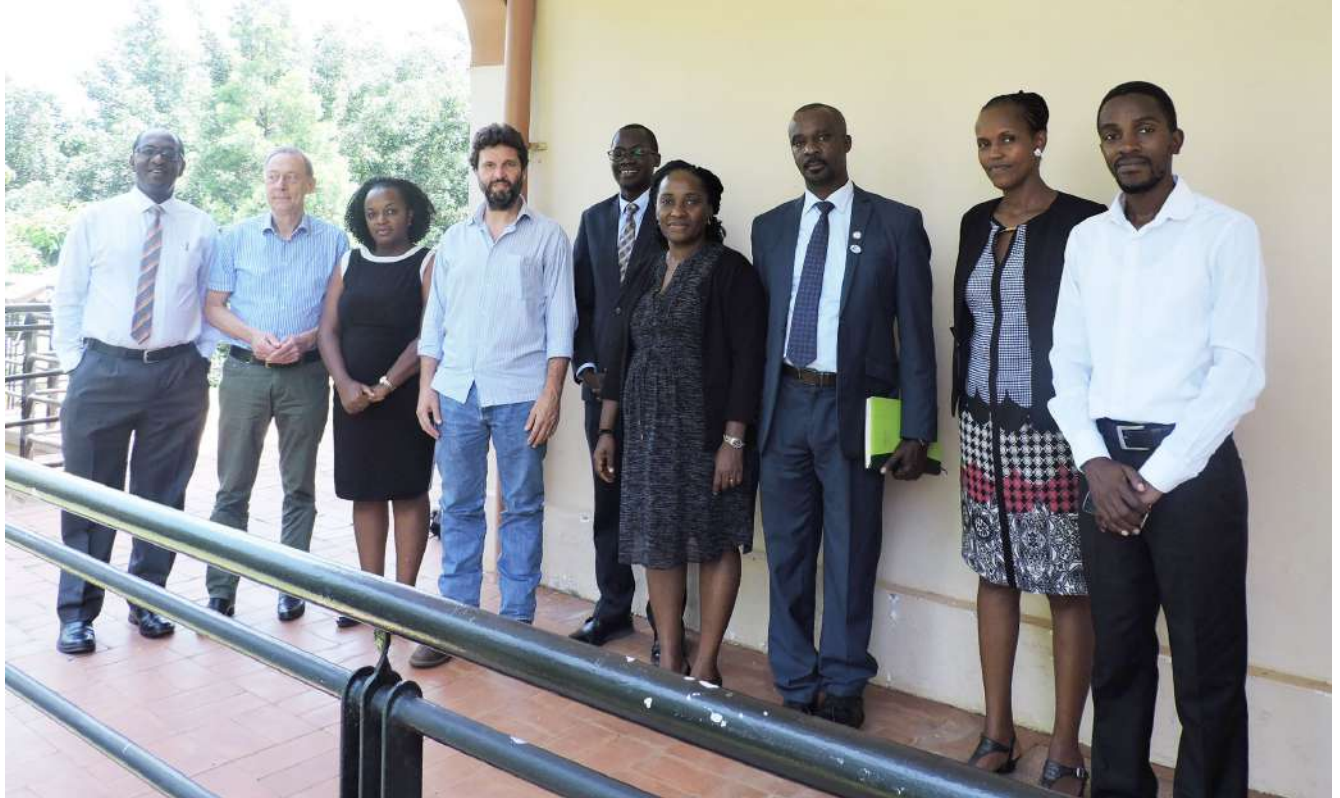
Representatives from consortium members.