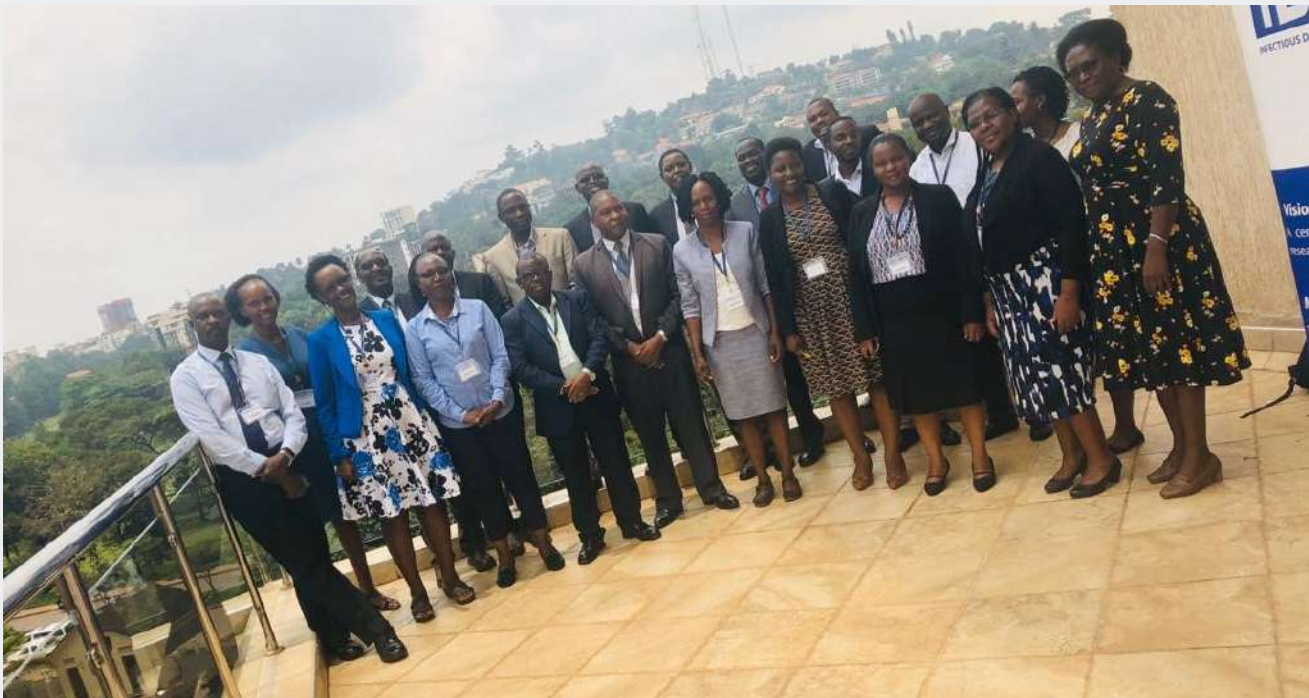
Representatives from the consortium.

A national project launch and kick off meeting for the INTEGRATED HIV/HTN project that will study the integration of hypertension in health facilities in 26 districts of south western Uganda was held in Kampala on 2nd March to create awareness and engagement of stakeholders from various public and private health institutions. The meeting was attended by representatives from Uganda AIDS commission, National Medical Stores, Makerere University College of health sciences, Uganda Heart Institute (UHI), Makerere University School of Public Health, NOVARTIS, Makerere Joint AIDS Program (MJAP), Ministry of Health NCDs Department, Uganda NCD Alliance (UNCDA), Infectious Diseases Institute (IDI), The AIDS Support Organization (TASO) -MRC, and WALIMU.