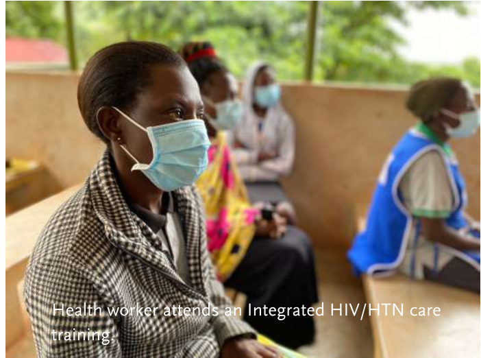
Health worker attends an Integrated HIV/HTN care training.