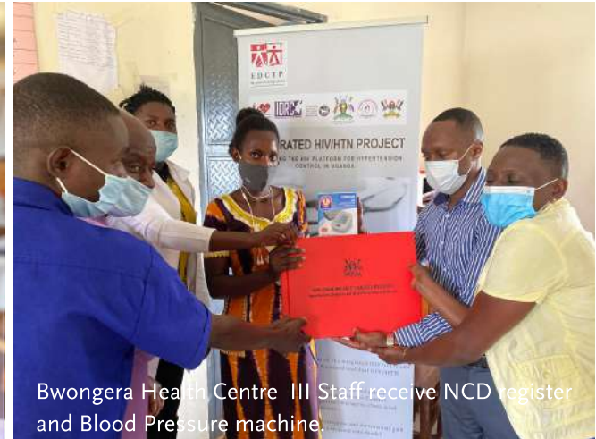
Bwongera Health Centre III Staff receive NCD register and Blood Pressure machine.