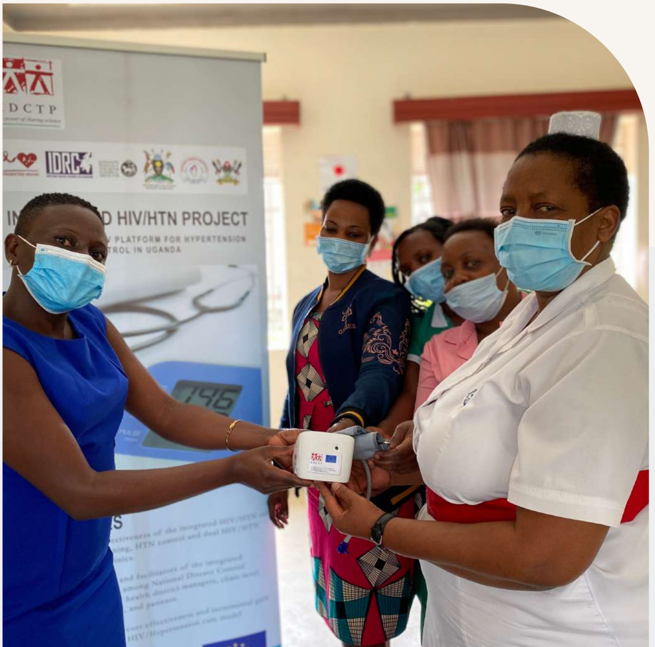
Part of the Ntungamo Health Centre IV team receive a blood pressure machine donated by the Integrated HIV/HTN project.

The project launched the Integrated HIV/HTN Care Model in selected health facilities in south western Uganda. The selected health facilities were supported Blood Pressure Machines, Non-Communicable Diseases (NCD) Patient Registers and NCD Patient Cards issued by the ministry of Health in Uganda.