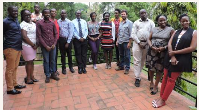
Part of the Project Implementation Committee.

At the start of the project the project implementation committee was formed. The committee is responsible for the day to day implementation of project activities. The committee is led by the Project Coordinator. The members of the implementation team are Program Manager, representatives from all collaborating institutions, namely; Uganda Heart institute, London School of Hygiene and Tropical Medicine and ministry of Health Uganda. Other members are Infectious Diseases Research Collaboration core administration team which comprises of the Finance Manager, the Administrative Manager, the Human Resource Manager, the Grants Manager, the Procurement Manager, and the Monitoring and Evaluation Specialist. The PIC meets regularly to set weekly targets, review progress against weekly work plans, identify and address any work-related challenges.