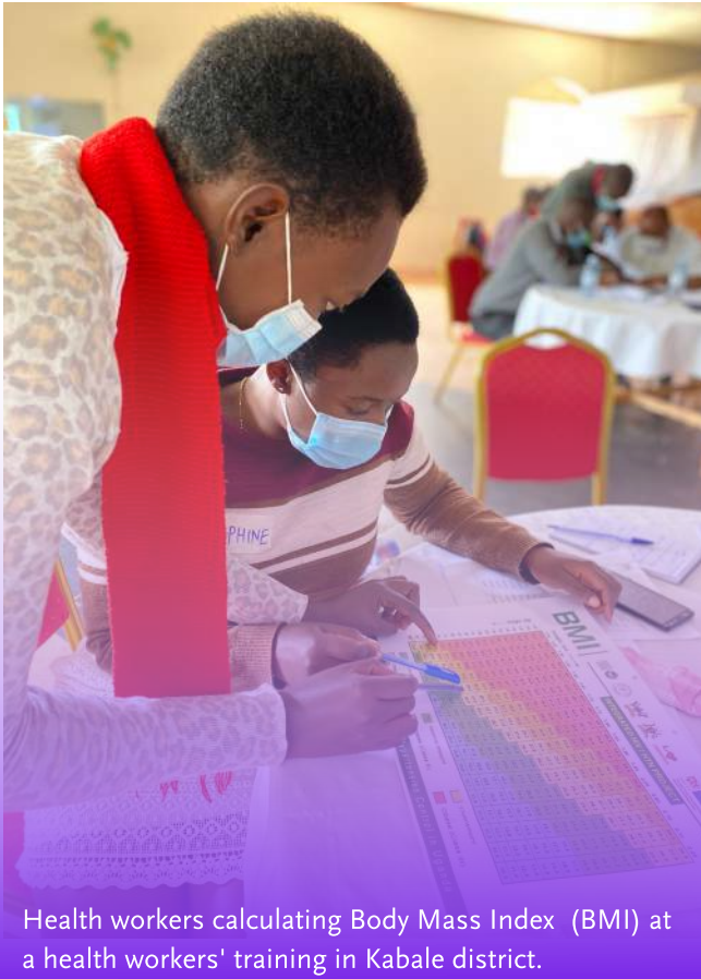
Health workers calculating Body Mass Index (BMI) at a health workers' training in Kabale district.