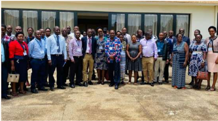
Stakeholders at the regional kick off meeting.

The INTEGRATED HIV/HTN project regional launch and kick off meeting was held, in Mbarara on 19th March 2020 to create awareness and acquire regional stakeholder buy-in and engagement from various actors in the health sector, in the western and south Western region. The meeting was attended by representatives from The Ministry of Health (MoH) Uganda, Uganda Heart Institute (UHI), the community advisory board (CAB), Implementing partners like Baylor Uganda and The AIDS Support Organization (TASO), District Health Officers (DHO) and HIV Focal Persons from districts of Kisoro, Rubanda, Rukiga, Rubirizi, Kabale, Kanungu, Buhweju, Sheema, Mitooma, Rukungiri, Bushenyi, Ntungamo, Lyantonde, Kazo, Mbarara, Rwampara, Kiruhura, Rakai, Isingiro, Ibanda, Kasese, Kamwenge, Kibaale, Kabarole, Kitagwenda, and Kyenjojo. Policy issues on non – communicable diseases (NCD), advancements in Hypertension care and the Integrated HIV/HTN project overview were discussed, as participants pledged their support towards the project.