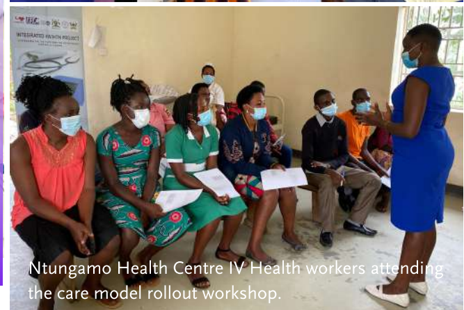
Ntungamo Health Centre IV Health workers attending the care model rollout workshop.