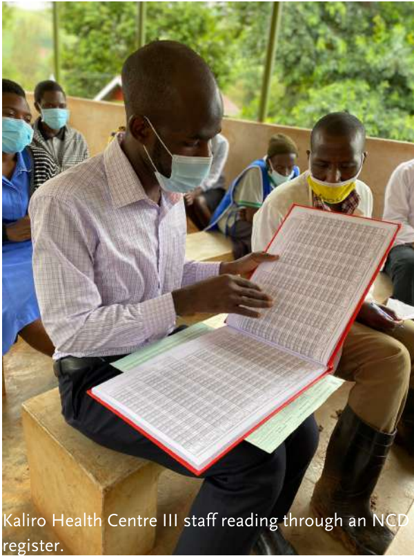
Kaliro Health Centre III staff reading through an NCD register.